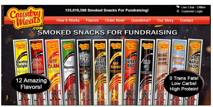
fundraiser to help the Scouts pay for themselves.

IF interested - more details available at: https://www.erieshorescouncil.org/WRC