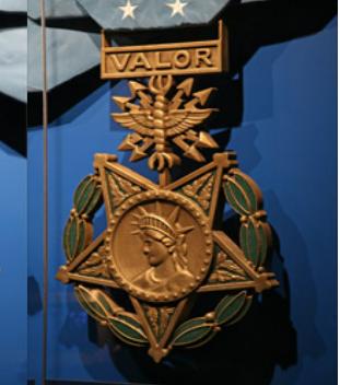
US Navy & Marines