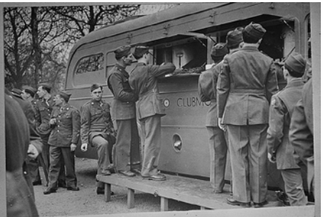
Passing out "free" doughnuts to servicemen during the war...