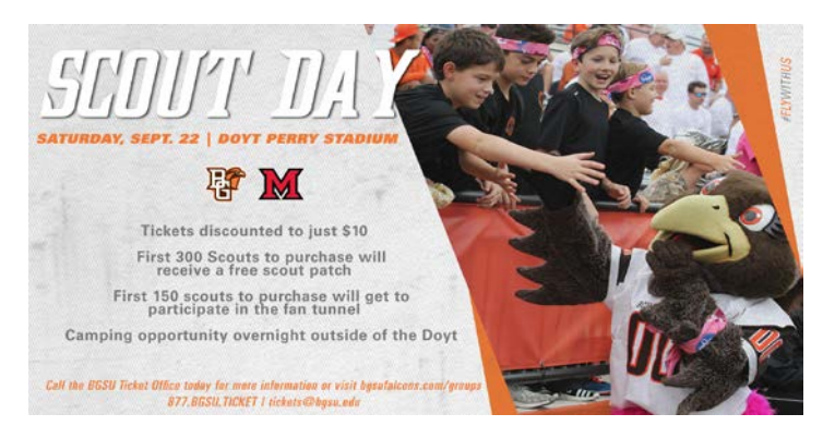
September 22nd @ BG as they face Univ of Miami

The Walleye usually offer 3 games for "SCOUT EXPERIENCE" dates to go to each season. The 2018 - 2019 dates are not available as of yet, but we'll let you know when they are ASAP because these games sell out pretty fast! There is also an opportunity for Sleepovers after the games too... MORE FUN!