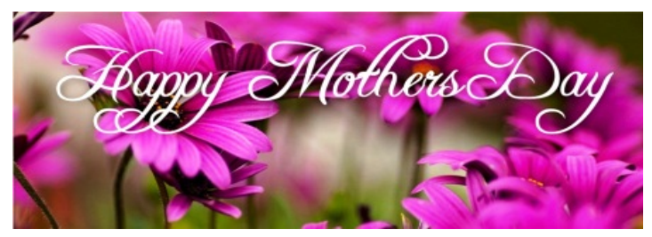
May 14th this year ~ take a moment to wish your mothers (and/or spouses) a Happy Mother's Day everyone

May's District Meeting on May 11th is the annual District Recognition Dinner. All of the Leaders are welcome to come out and share the evening's fun, friendship and awards presentations to Scout Leaders within the District for their efforts this past year.