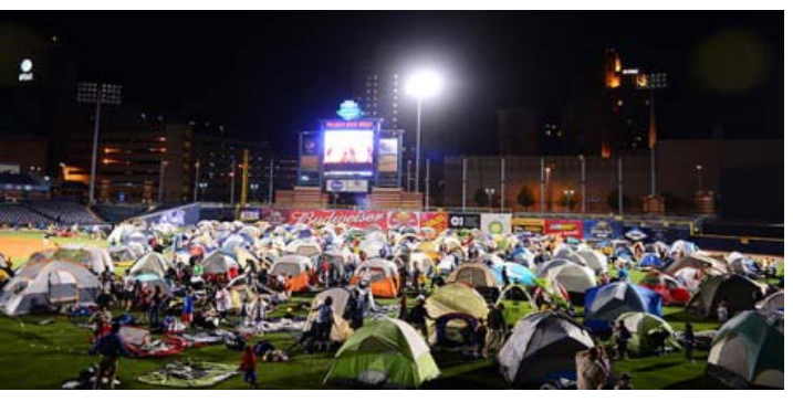
the 2014 Mud Hens Sleepover on 5/3rd Field

Activities included an On Field Parade before the game, meet the mascots, post game fireworks, Scouts can run the bases, a Family (friendly) movie, the sleepover*, an all you can eat breakfast and, of course, the game too!