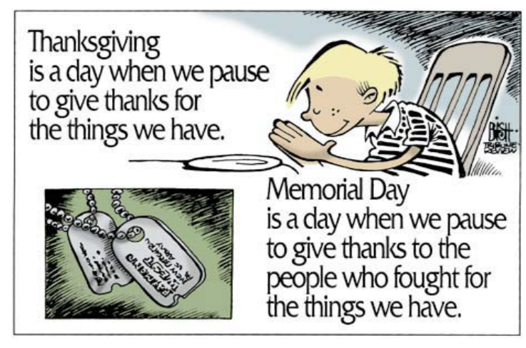
With gratitude ~ Thank You!

The WHOLE family is welcome to sleepover too!!