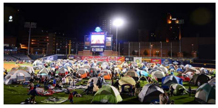
the 2014 Mud Hens Sleepover on 5/3rd Field

Activities included an On Field Parade before the game, meet the mascots, post game fireworks, Scouts can run the bases, a Family (friendly) movie, the sleepover*, an all you can eat breakfast and, of course, the game too!