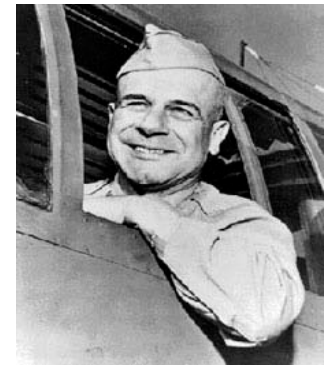
Lt Col James Doolittle

After the US Army Air Forces came into existence, the Army Ground Forces retained the use of light aircraft to support their efforts. In 1947 the Army developed light planes and rotary wing aircraft to support ground operations. Flying the H13 Sioux Helicopter, O-1 Bird Dog airplane all the way to the forming the 1st Calvary Division (Airmobile) in 1961 to support combat in the Vietnam conflict flying the UH-1 Iroquois (or Huey) helicopters starting in 1964. Today the UH-1 still flies along with many other faster and lighter attack helicopters like the AH64 Apache.