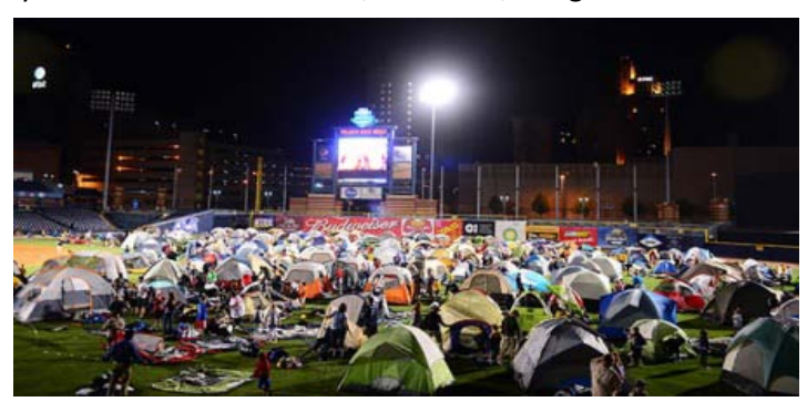
the 2014 Mud Hens Sleepover on 5/3rd Field

Activities included an On Field Parade before the game, meet the mascots, post game fireworks, Scouts can run the bases, a Family (friendly) movie, the sleepover*, an all you can eat breakfast and, of course, the game too!