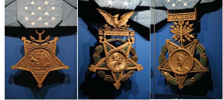
US Navy & Marines

There are actually 3 versions of the Medal of Honor, one for each branch of the service.