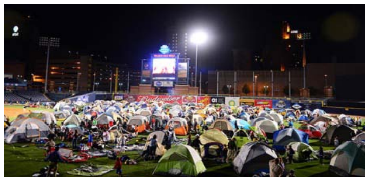
the 2014 Mud Hens Sleepover on 5/3rd Field

Activities included an On Field Parade before the game, meet the mascots, post game fireworks, Scouts can run the bases, a Family (friendly) movie, the sleepover*, an all you can eat breakfast and, of course, the game too!